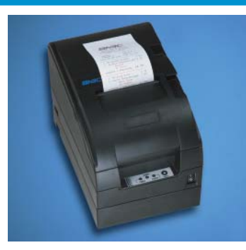
Conceal the Power Supply in the Optional Power Supply Cover