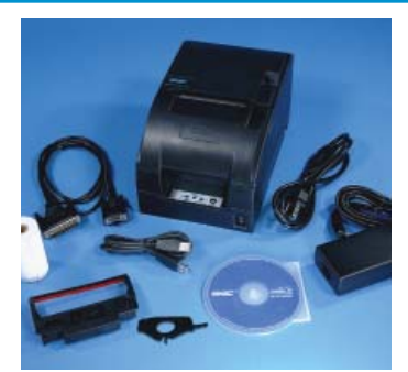
Includes Everything Necessary in the Carton