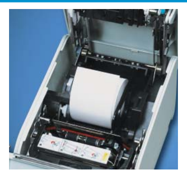
Drop and Print Paper Loading with Built-In Paper Width Selector