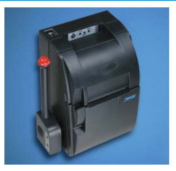
Built-In Wall Mount Capability and Optional Audio/Visual Print Messenger