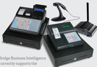
Bridge Business Intelligence currently supports the SAM4S ER285 and ER900 models with support for additional models coming soon.