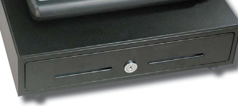
SAM4s ER-945 and ER-920 shown with optional card reader.

Preset PLUs facilitate fast and accurate registrations. With 150 key locations, the flat, spill-resistant keyboard can easily accommodate large menus with preset keys for each item. Where menus change daily with breakfast, lunch or dinner times the paper key-sheet under the overlay is easily exchanged. A simplified check tracking feature is available for bars and cafes.