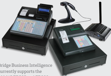
Bridge Business Intelligence currently supports the SAM4S ER285 and ER900 models with support for additional models coming soon.